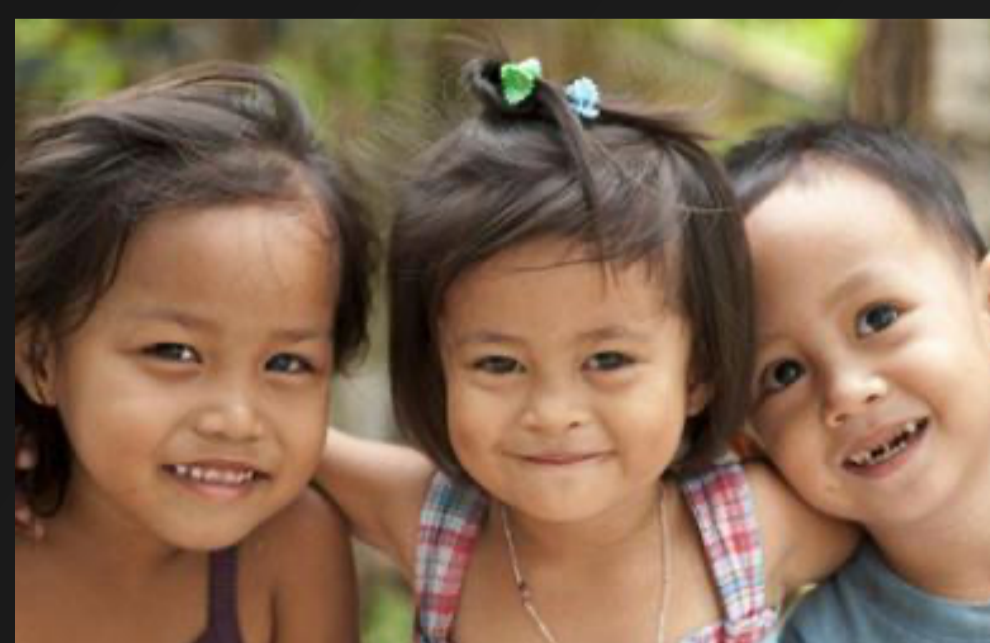
ENERGÍA PADRE BURGOS, LEYTE, FILIPINAS

En colaboración con KinderHilfe Philippinen e.V., la Greenfinity Foundation ha construido en la isla Leyte dos instalaciones fotovoltaicas para la San Roque Elementary School y el "Kinderdorf".