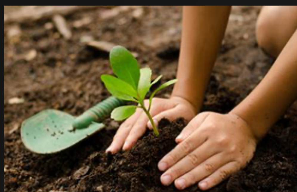
HÁBITAT NATURAL HUNGRÍA

La Greenfinity Foundation se ha propuesto plantar miles de árboles en Hungría junto con escuelas y socios locales. Esta campaña no está dirigida solo a proteger el medioambiente, sino también a la sensibilización de su población.