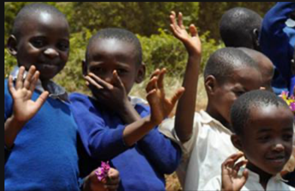
PROYECTOS EDUCATIVOS SHIMBWE, TANZANIA

Pobreza, enfermedades, hambre, trabajo infantil,... son solo algunos de los desafíos a los que los habitantes de la región de Moshi en Tanzania tienen que enfrentarse diariamente. En colaboración con la organización C-re-aid, la Child & Family Foundation pretende mejorar las condiciones de vida de sus habitantes.