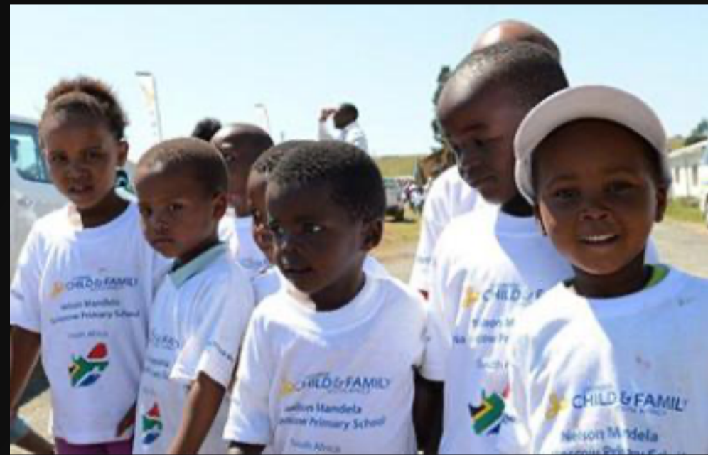
PROYECTOS EDUCATIVOS QUNU, CABO ORIENTAL, SUDÁFRICA

Las instalaciones de la Escuela de primaria No-Moscow en Sudáfrica se encontraban en muy mal estado, y fue entonces cuando la Child & Family Foundation decidió construir una nueva escuela para ofrecer a los niños una mejor calidad en su educación y en su vida.