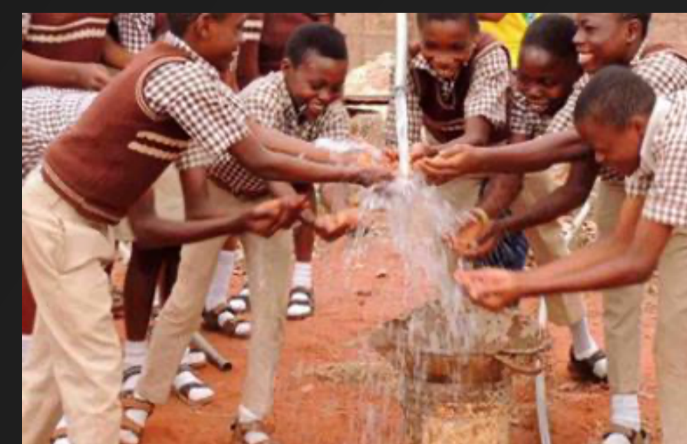
AGUA UROMI, NIGERIA

Aunque la Holy Trinity School tenía una fuente de agua potable, la bomba y los grifos estaban estropeados. Por lo tanto, tenían que comprar agua, que se vende a un precio bastante elevado. La Greenfinity Foundation financió la reparación de la fuente.