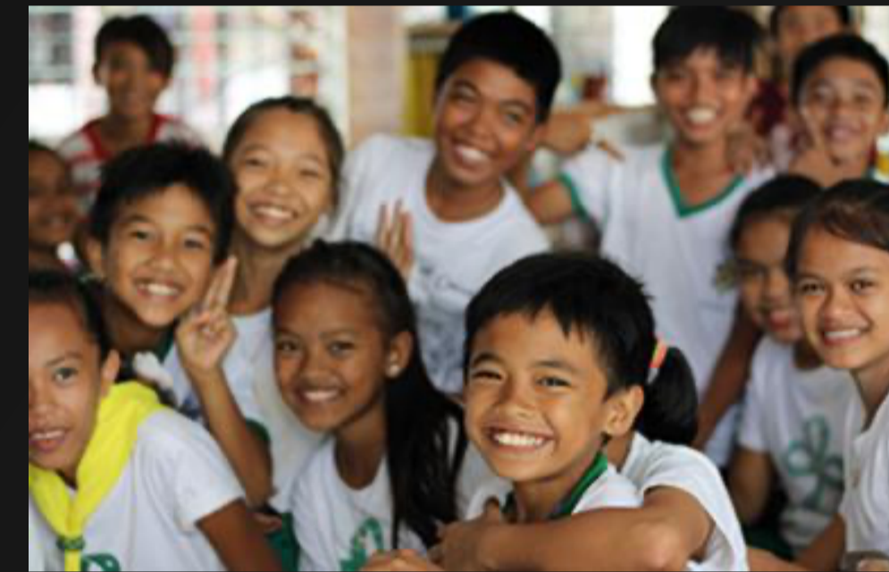
PROYECTOS EDUCATIVOS LEYTE, FILIPINAS

Según el dicho popular, no aprendemos para la escuela, sino para la vida. Este principio también se aplica en la ayuda que la Child & Family Foundation presta en Filipinas: además de la educación escolar sólida en unos edificios reformados, los niños aprenden habilidades que les serán de gran utilidad en su día a día.